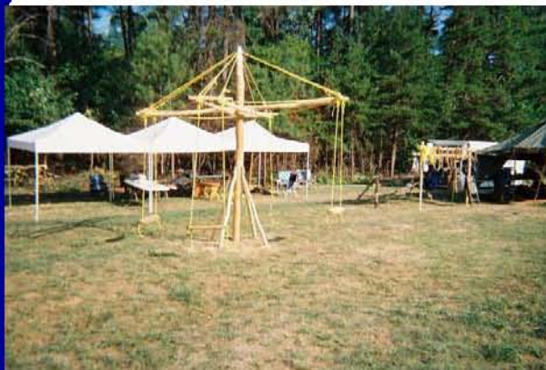
Pioneering Merry Go Round like the one that will be at the Council Camporee May 13 - 15, 2011

13 - 15 Boy Scout Camporee at the Kenyon property in Clay County Complete leaders guide on the web at www.nfccamporee.org